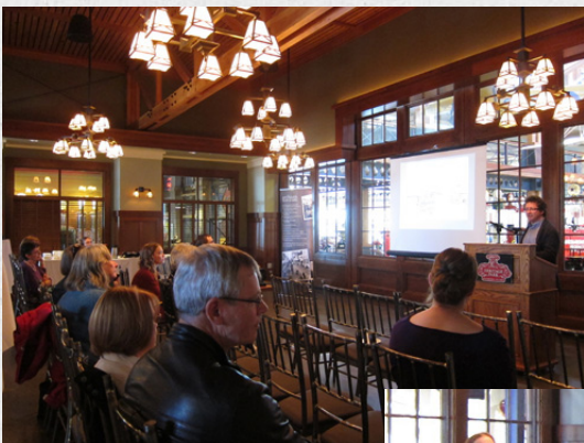
Attendees at the 2014 Archives Launch held at Heritage Park in Calgary

Several archives held events in celebration of the week around the "Creepy Alberta" theme. Most notably, the City of Edmonton Archives had an exhibit featuring the history of Halloween in Edmonton, "Tonight's the Night." This exhibit received publicity on CKUA, http://www.ckua.com/artbeat-oct-26-nov-1/ and on Breakfast Television, Edmonton. There were other exhibits, a film night and sharing of stories at other archives throughout the province. For Archives Week 2014, six institutional members held events. ASA would like to encourage more of its institutions to participate in Archives Week next year. Archives Week is a great opportunity to promote your archives and seek publicity. ASA thanks all those institutions that held events to celebrate the week!