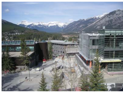
View of Banff Centre campus. New construction at right will include new archives facility.