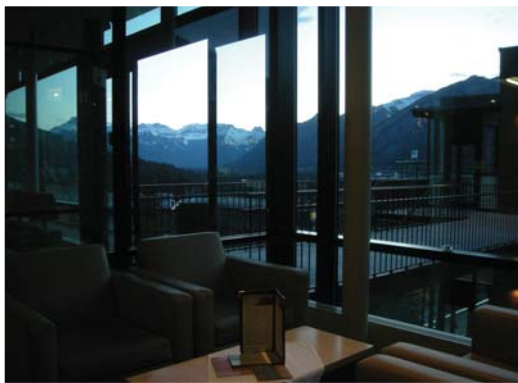
View from Three Ravens