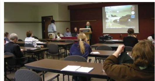
Conference session in progress